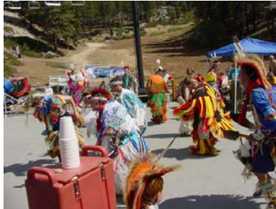
PowWow held at 2002 W3B

the ones that circle around them. The powwow brings the circle of people closer.