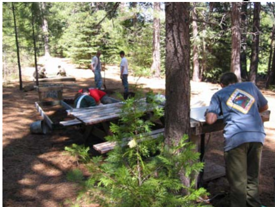
Candidates Perform Valuable Service at 2004 Lassen Ordeal

The lodge inductions process is upon us. This process helps revitalize the chapters and the lodge membership.