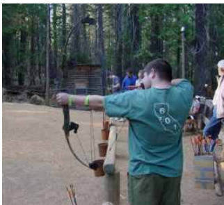
One of the Many Programs offered at the 2002 Fall Fellowship

I cannot encourage each of you enough to always step forward to serve in you troop, family, religious community, lodge and chapter. Service is not limited to just Scouting but rather, is connected to everything we do and the people we meet every day. Service is putting into action the Scout Oath, Law and admonition. Members of our units, who saw in us something special, chose us as worthy to lead and act by example and make everything we touch a little better.