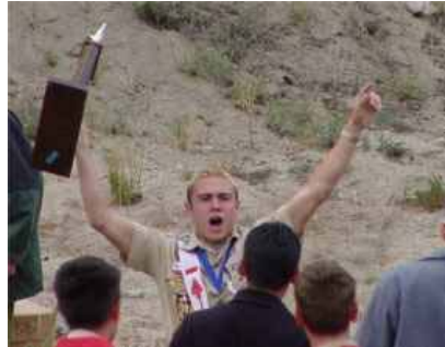
Amangi Nacha Lodge Chief Receives Bald Eagle Trophy at 2002 W3B Conclave

Each year the section puts on a Conclave. A weekend of fun and fellowship. It is hosted by one of the six lodges which rotates each year. The host or service lodge, along with the section Council of Chiefs (COC) plan and organize the event. The Section COC is made up of the lodge chiefs from each of the mem-