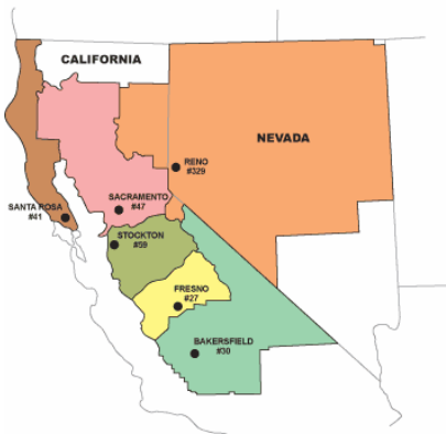
Map of the W3B

The W3B Conclave is a great time for all Arrowmen, new and seasoned members alike. Register now online at " http://www.sectionw3b.org/Conclave/registration.cfm "