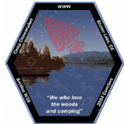
2004 W3B Conclave Patch