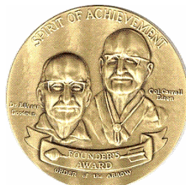
The Founder's Award