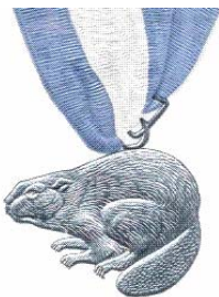
The Silver Beaver