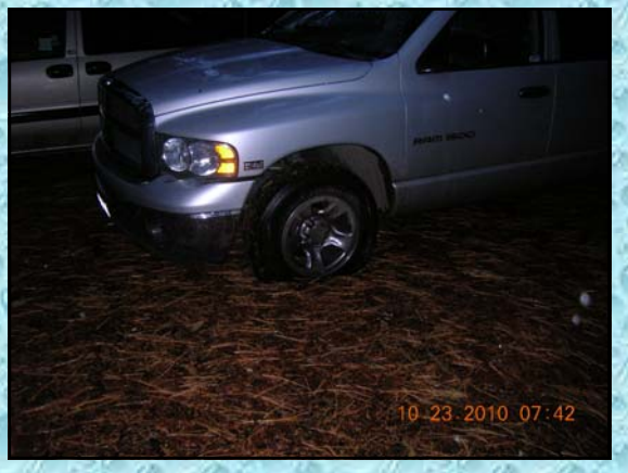
Lassen DR (During Rain) (Told you it was flat)