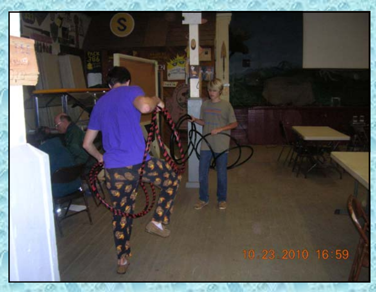
Hoop Tangle Class with the Hoopers