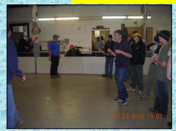
Chicken Dance Demo