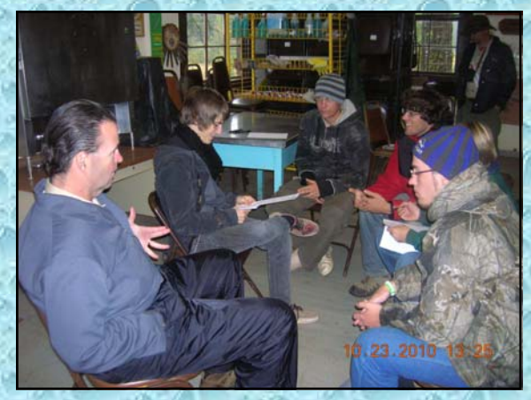
Serious class on hand gestures