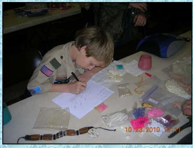
Dear Mom, it's raining outside, I don't have my iPod, there's no Wi-Fi for me and I have to do something with all of these beads.....