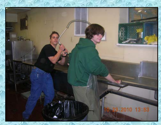
Indoor water sports!