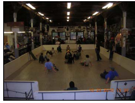
Lassen Indoor Soccer Arena

Our aging Ordeal members books and what a way to finish it also had a chance to earn their off with a great weekend indoors at Brotherhood sash. The AIA Cere-Camp Lassen. No, it didn't rain nor monies Team is always prepared was it foggy inside, but getting and ventured out to conduct the there for many was quite an experi- special Brotherhood Ceremony to ence. It was foggy for some, windy make it a memorable experience and rainy for others. One of our for our new Brotherhood members. ence changing a tire before he through with plenty of warm food went home. Glad he and his crew and kept everything comfortable for have plenty of outdoor experience us. It was nice, entertaining, and so a 42 degree rain wasn't really relaxing weekend of fellowship. Join us next year for another one!