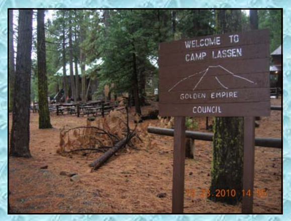
Lassen BR (Before Rain)