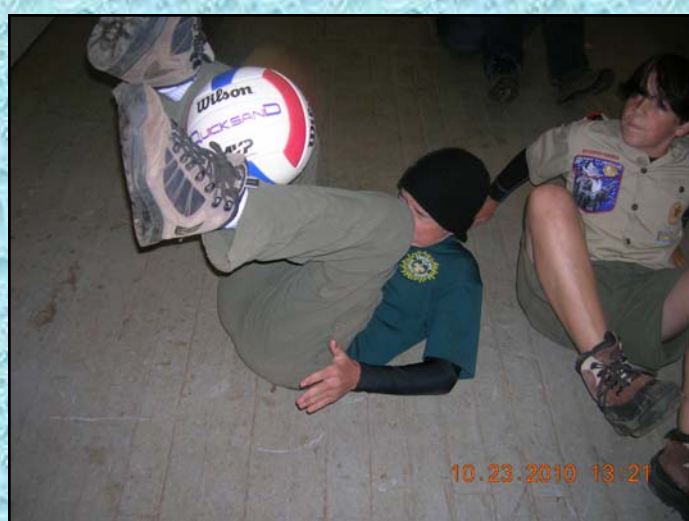
I got it!