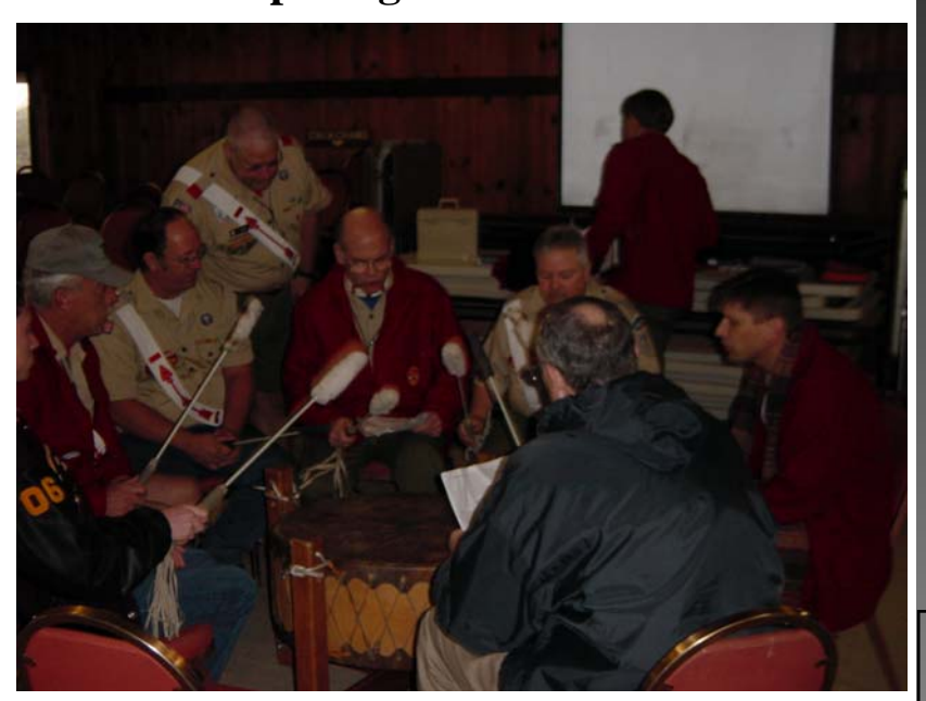
Members of the Lodge Practice Singing

The National Order of the Arrow Conference (NOAC) is fast approaching and members of the lodge have already begun practicing for the many competitions that the lodge has the chance to compete in and to shine at the national level. At the February COC the lodge drum team practiced their singing ability while members of other activities practiced their parts.