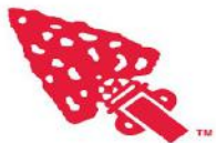
Amangi Nacha Lodge Members