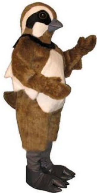
Quail Bird Mascot Costume