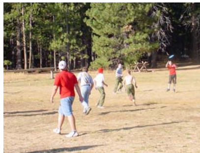
Frisbee at the 2002 Fall Fellowship

Saturday starts with breakfast that is cooked and served cafeteria style, like all the other meals, typically by adult volunteers. The morning and afternoon activities vary depending on the location of the Fellowship.