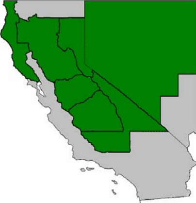
Geographical Area of the W3B

Amangi Nacha Lodge is one of six lodges that make up the Western Region, Area 3, Section B (W3B). The W3B includes most of Northern and Central California and the majority of Nevada as shown in the map below.