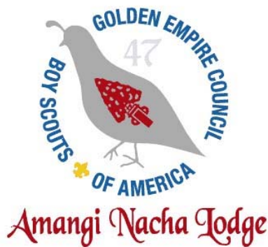
New Polo Shirt Logo

All chapters need to continue to flow their ideas through lodge committee members. This is the only way the lodge can serve you.