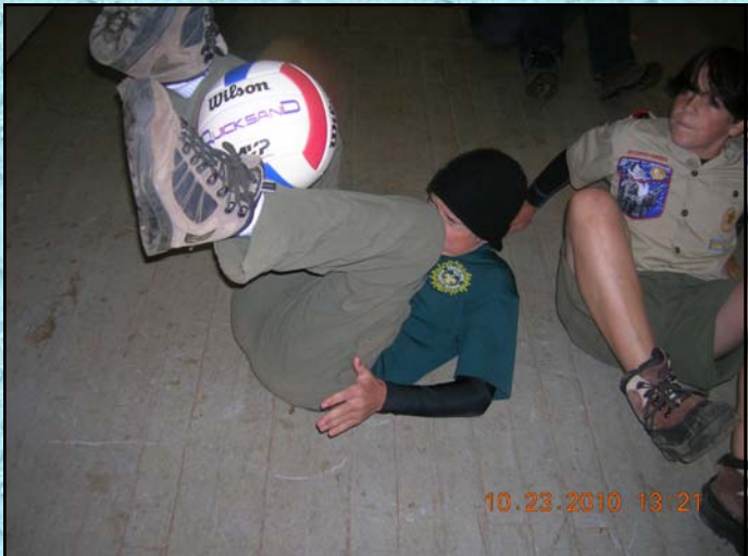
I got it!