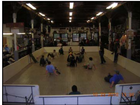
Lassen Indoor Soccer Arena

Our aging Ordeal members also had a chance to earn their Brotherhood sash. The AIA Ceremonies Team is always prepared and ventured out to conduct the special Brotherhood Ceremony to make it a memorable experience for our new Brotherhood members. As usual, our Cooking staff came through with plenty of warm food and kept everything comfortable for us. It was nice, entertaining, and relaxing weekend of fellowship. Join us next year for another one!