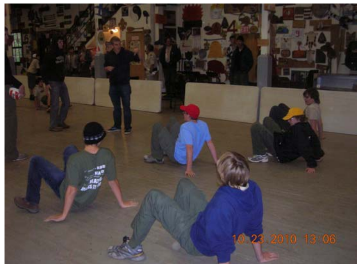
Indoor Crab Soccer