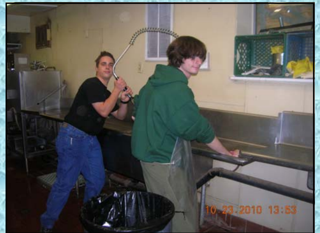
Indoor water sports!