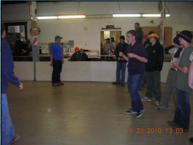
Chicken Dance Demo