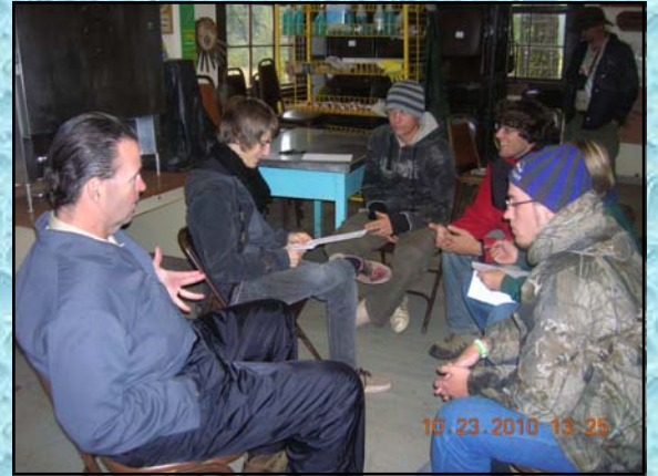
Serious class on hand gestures