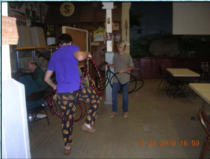
Hoop Tangle Class with the Hoopers