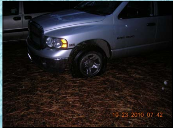
Lassen DR (During Rain) (Told you it was flat)