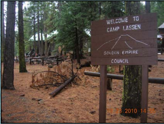
Lassen BR (Before Rain)