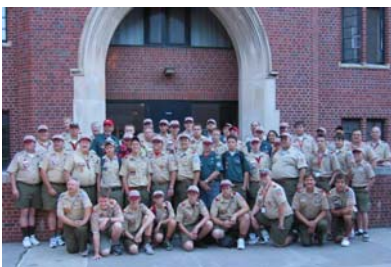
2004 NOAC Lodge Contingent

The Lodge Contingent is back from Iowa State University and the 2004 National Order of the Arrow Conference (NOAC). After a week of nonstop activities the contingent members returned to Sacramento physically tired but full of memories and an desire to bring what they learned back to their lodge and chapters.